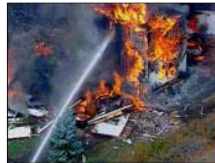
Keyspan Gas Explosion-Outage 2006