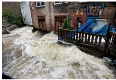
Local Flooding – May 2006